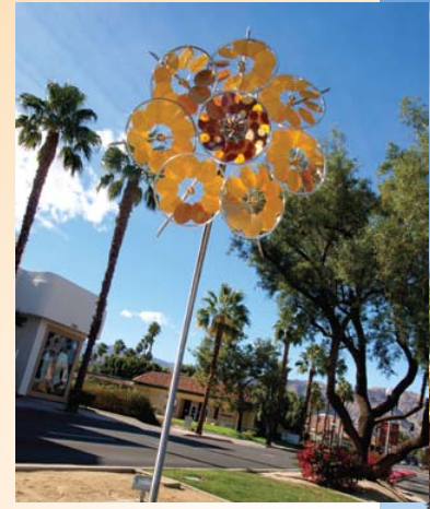
"Sunflower" by Patricia Vader

The popular El Paseo Invitational Exhibition and the City's extensive public art collection are reasons why the City of Palm Desert has been named one of five art destination cities in America by Southwest Art Magazine . For more information or to schedule a tour, please call 760-346-0611, ext. 664 or visit www.palmdesertart.org .