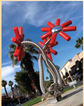
"Hot Metal Flower Bouquet" by Ron Simmer