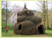
Bending Sticks: The Sculpture of Patrick Dougherty

The 2017 Palm Desert Public Art Documentary Film Series continues on March 16 with a free screening of Bending Sticks: The Sculpture of Patrick Dougherty .