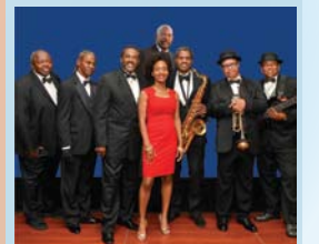
May 26 THE ELD WE BREZE BAND Mowtown/R & B