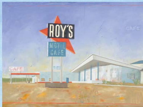
Roy's Motel and Cafe